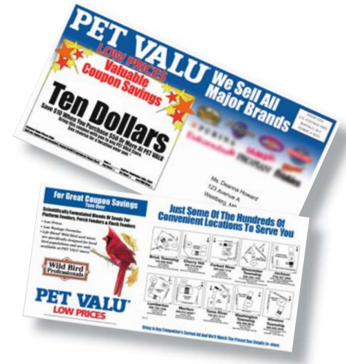
Pet Valu coupon with variable data: